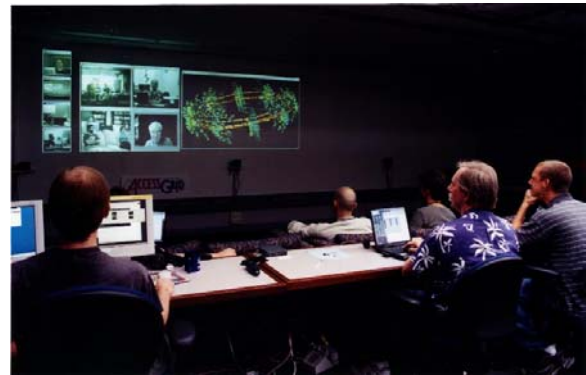
Figure 2. The Access Grid uses the Python CoG Kit (pyGlobus) as a major component to enable scientific collaborative sessions.

CoG Kits have also been incorporated in the Access Grid (Figure 2), an ensemble of resources that enables group-to-group collaborations amongst interdisciplinary scientists. The CoG Kit provides an efficient means for authentication and secure communication between different rooms.